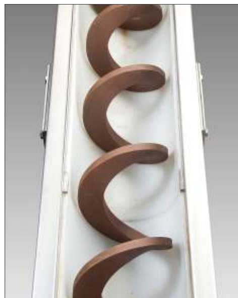
Shaftless Screw in UHMWPE Lined Trough